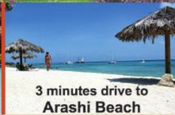
3 minutes drive to Arashi Beach